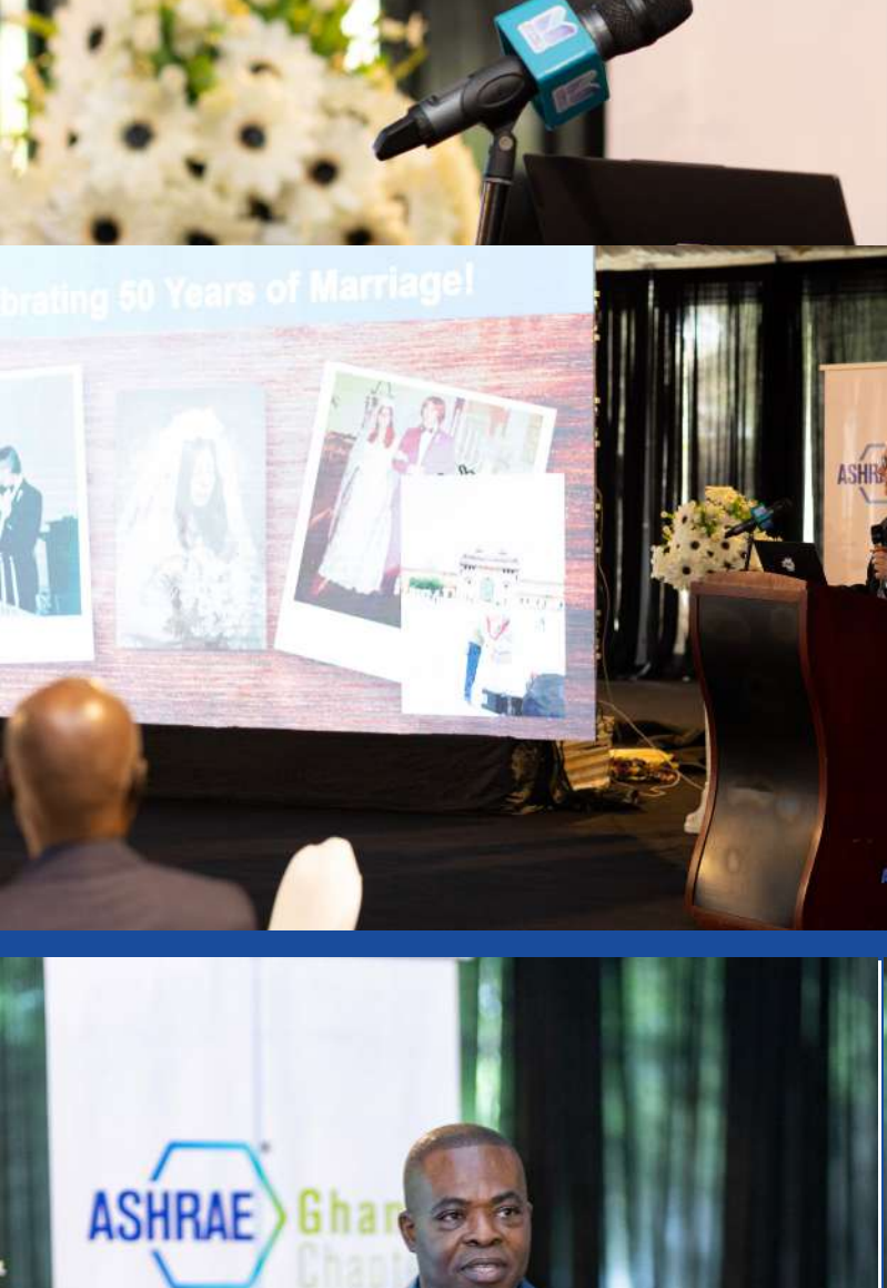
Prof. Lesley Lokko OBE, Presentation on "Trailblazers and Technocrats."